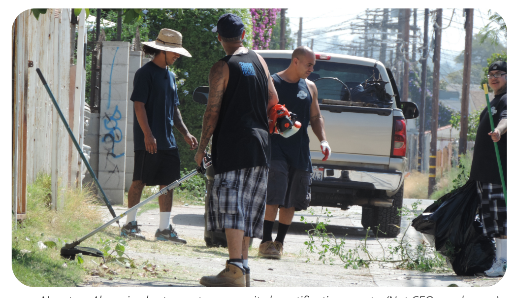
Nosotros Alumni volunteers at community beautification events. (Not CEO employees.)

Services that once began in New York State, have now become available in ten states and in thirty cities, including San Diego, CA. CEO has served over 34,000 individuals to remove employment barriers, instill self-confidence and find full-time employment. Through their Theory of Change model, CEO aims to break the cycle of recidivism by increasing accessibility of life skills, education, shortterm paid transitional employment, full-time job placement, and post-placement services for those that are eligible. To begin the eligibility process, the participant must first be referred by a parole or probation officer. Second, the participant will attend an orientation where they will bring a release form, government-issued photo ID, social security card or birth certificate.